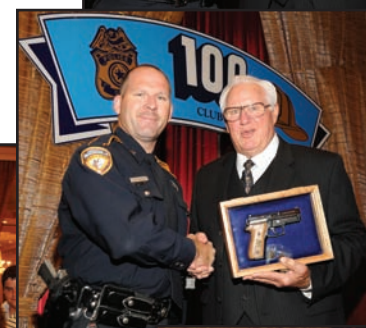
Law Enforcement Sig Sauer Commemorative Pistol