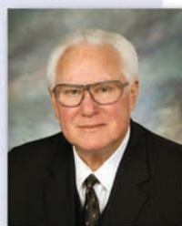
ALEXANDER'S FINE PORTRAIT DESIGN