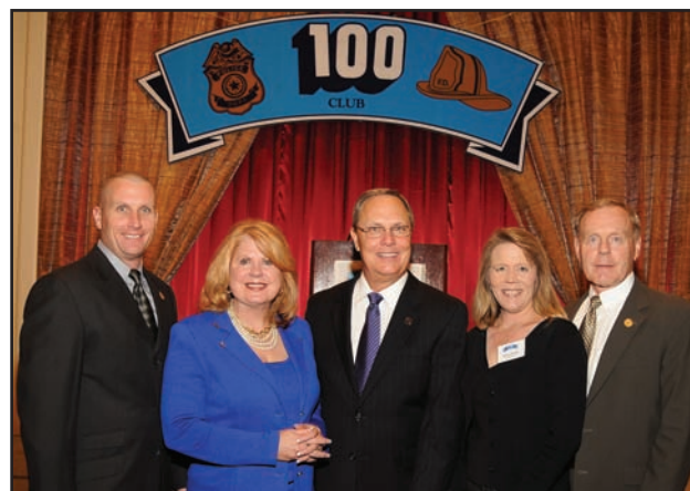
Special thanks to our friends at Chevron for their gift as a Presenting Sponsor.