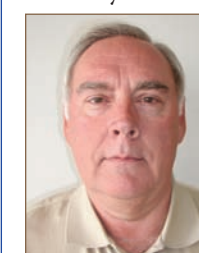
Elected March 2008