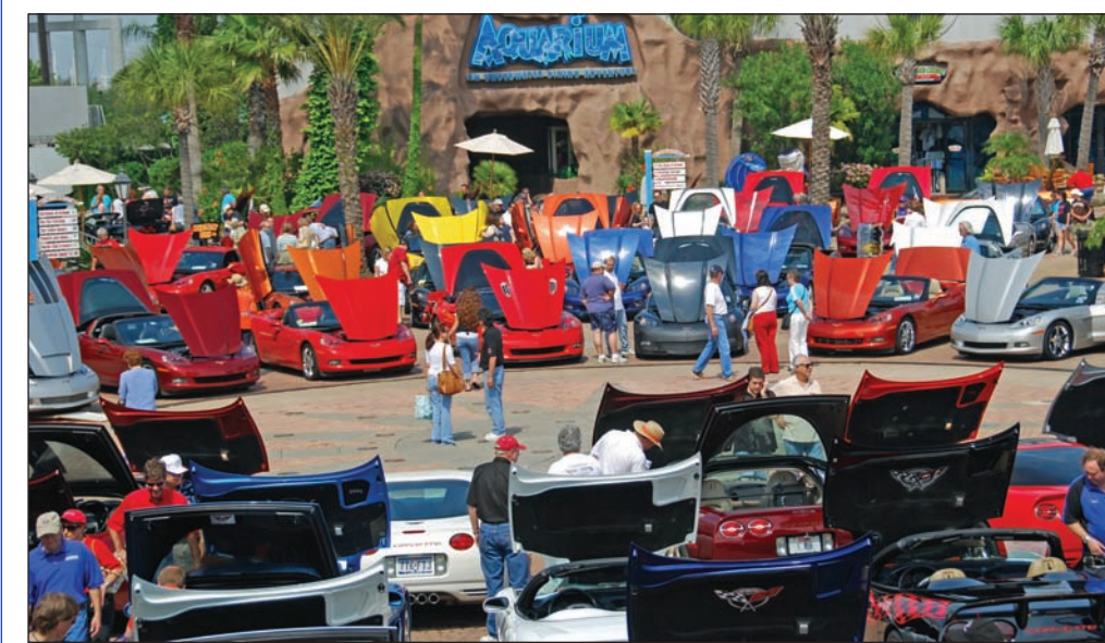
4th Annual San Jacinto Corvette Club "Corvette Show" held at the Kemah Boardwalk, Saturday, March 29th, 2008 with proceeds benefitting The 100 Club. 140 Corvettes were entered into the competition from six area Corvette Clubs.