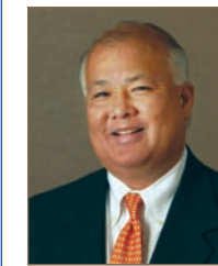
Elected April 2007