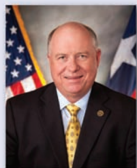
ALEXANDER'S FINE PORTRAIT DESIGN

Your help in recruiting only one (1) new member will go a long way in helping us to further our support of those who constantly protect each of us.